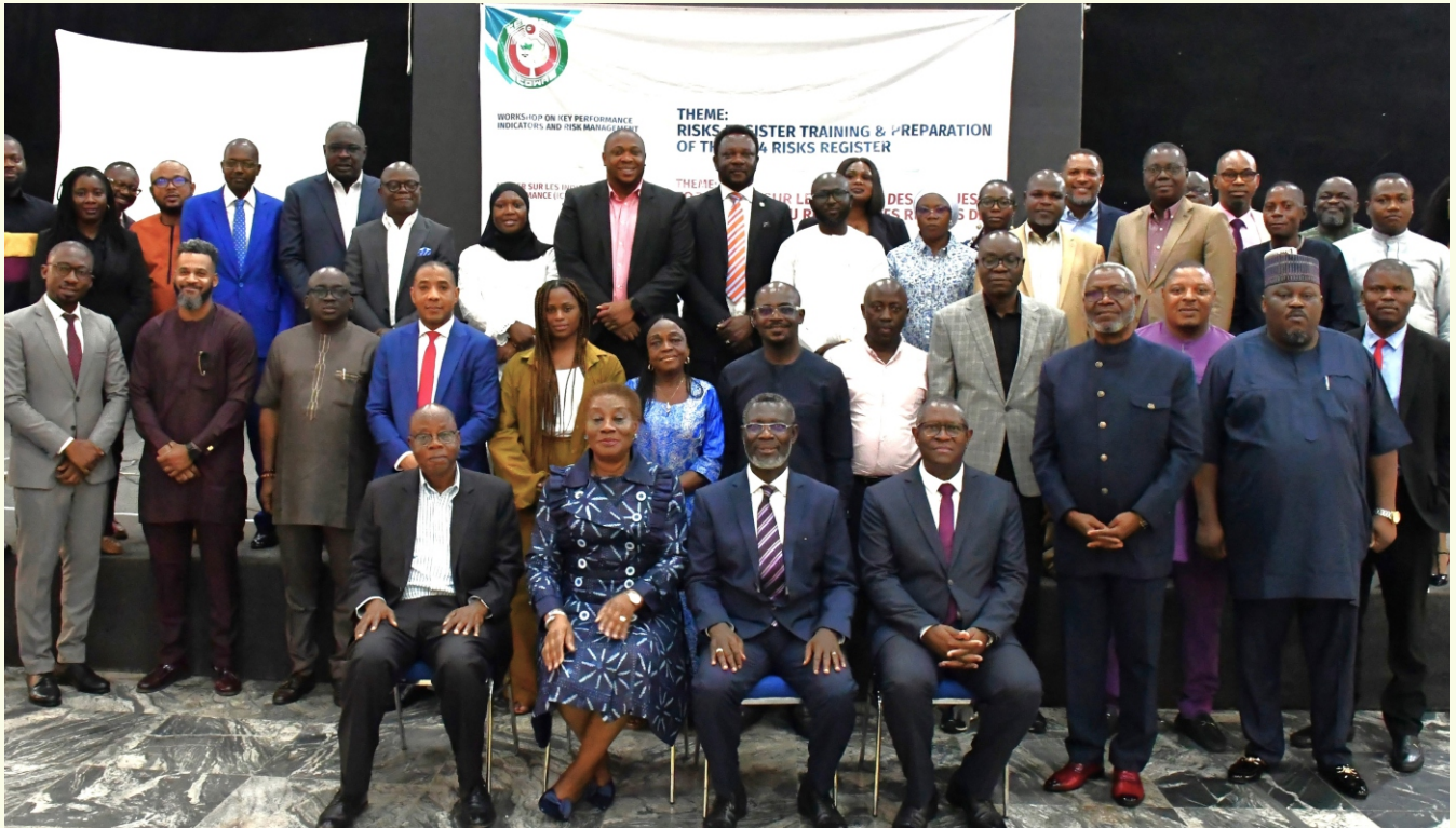
Group picture of judges and participants

The ECOWAS Court of Justice on Monday 27th November 2023 commenced a workshop aimed at reviewing its risk management strategies and developing a comprehensive risk register for 2024 under the theme "Risks Register Training and Preparation of the 2024 Risks Register."