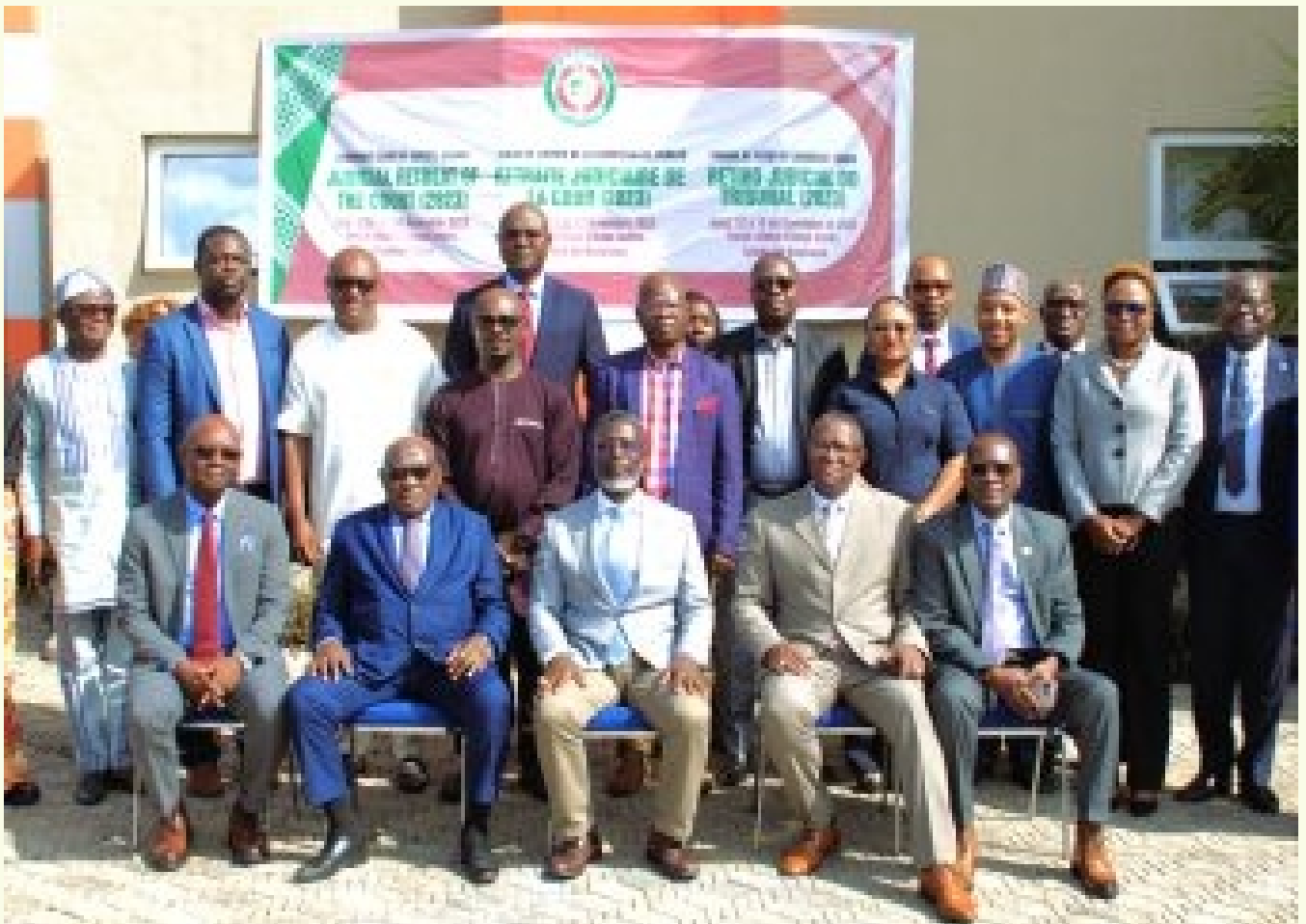
Judges and Staff of the Court at the 2023 Judicial Retreat

The judicial retreat is an important annual activity of the Court that affords the judges and legal staff of the Court the opportunity to reflect, review and where necessary develop an implementable action plan for the enhancement of the operations of the Court.