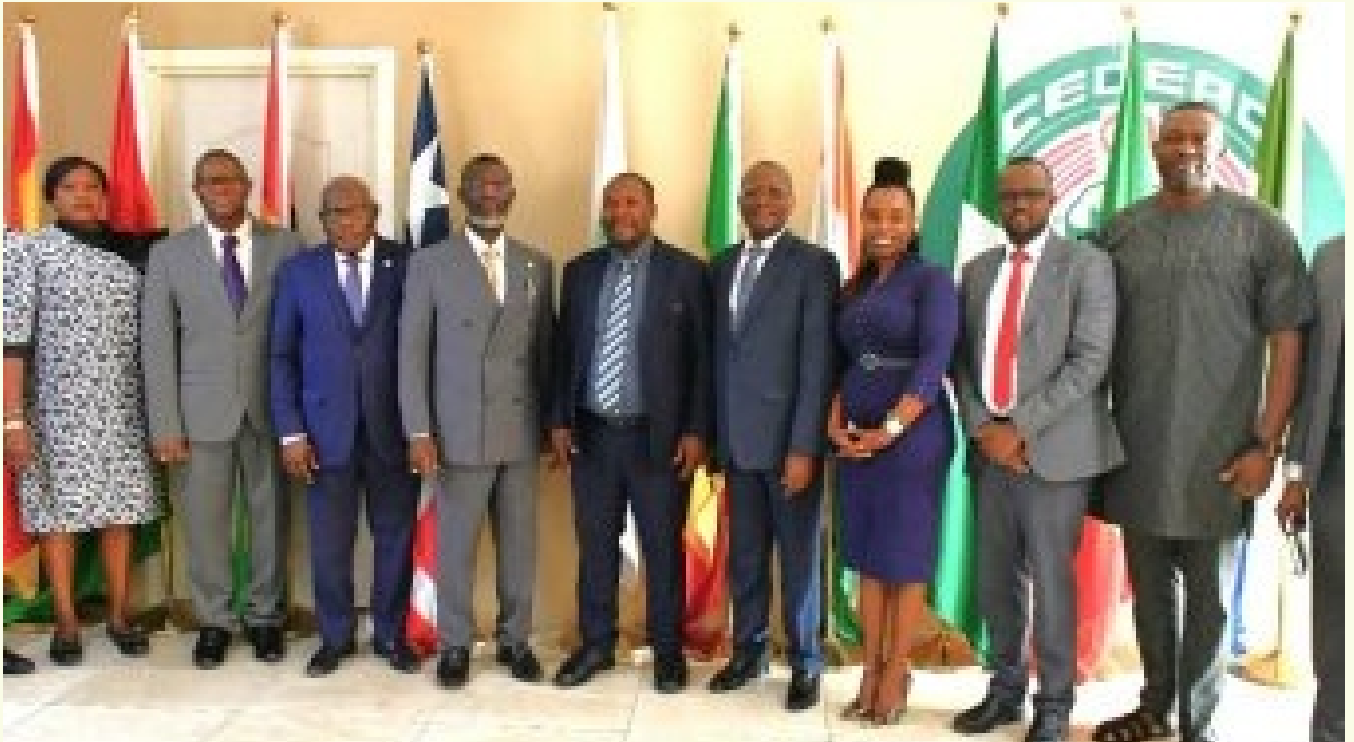
Judges of the Court with the visiting Members of Parliament from the Kenya National Assembly

Justice Edward Amoako Asante, President of the ECOWAS Court of Justice, underscored the critical need for citizen awareness regarding their fundamental rights during a courtesy visit by Members of Parliament from the Kenya National Assembly on Thursday, November 9, 2023.