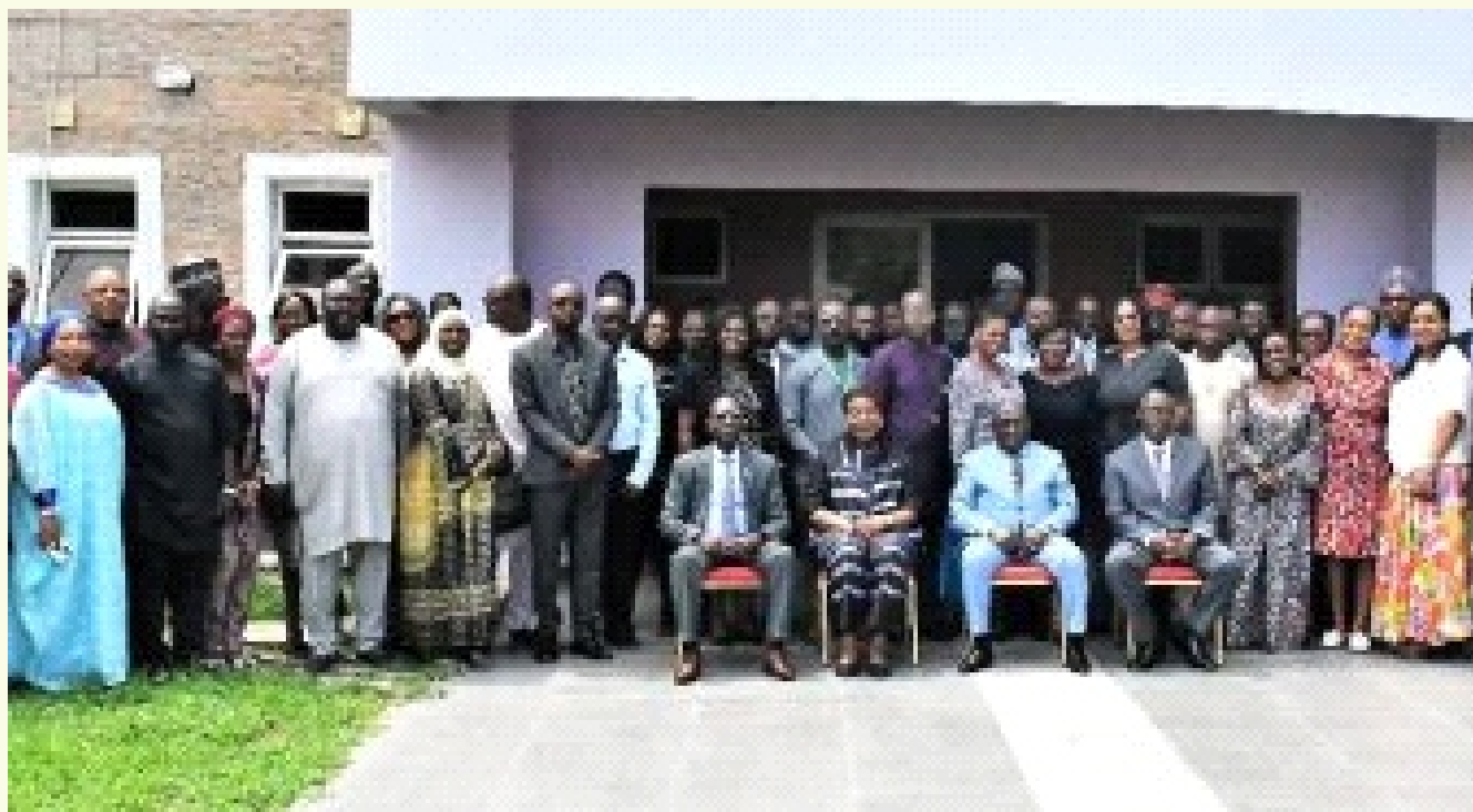
Judges and Staff at the opening session of the 15 Administration and Finance retreat of the Court

The Community Court of Justice has ended its annual administrative and budget retreat with the adoption of the work programme of the Court for the year 2024 following discussions and deliberations during the various working sessions dedicated to various aspects of the Court.