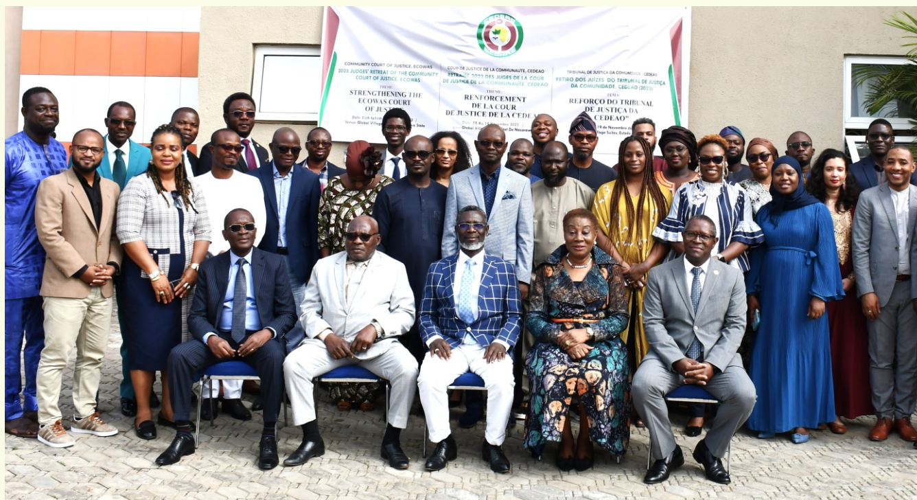
Judges of the Court (seated front) and staff after the opening ceremony of the judges' retreat