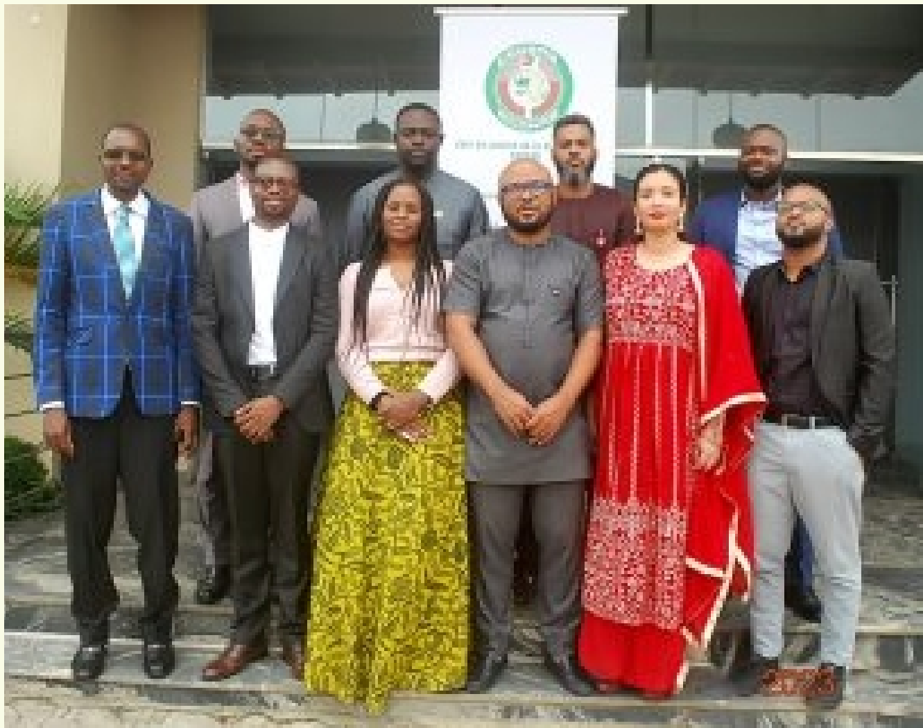
New staff from Language and IT divisions

The orientation program aimed at familiarising newly recruited staff members with the functioning of the various departments of the Court ended on Wednesday, October 11, 2023, in Nasarawa, a state of the Federal Republic of Nigeria.