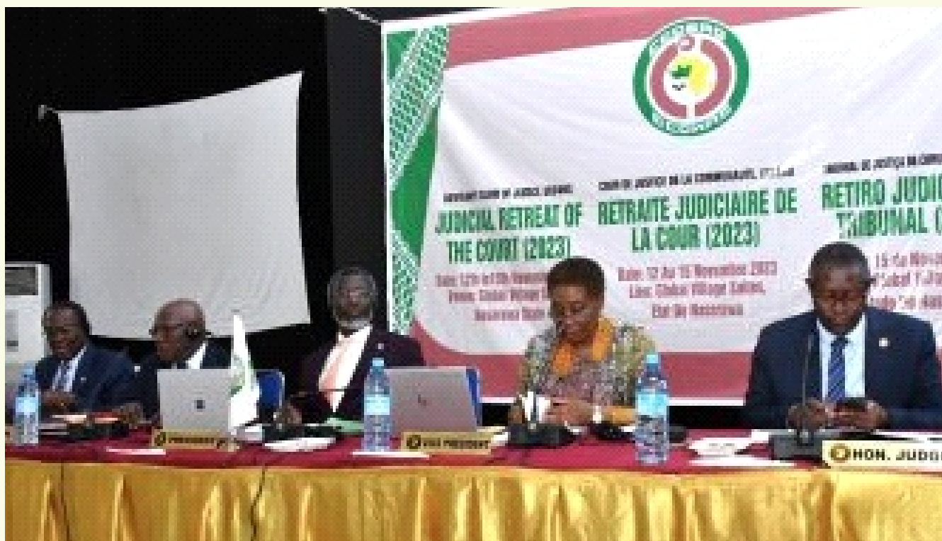
Judges of the Court at the 2023 Judicial Retreat