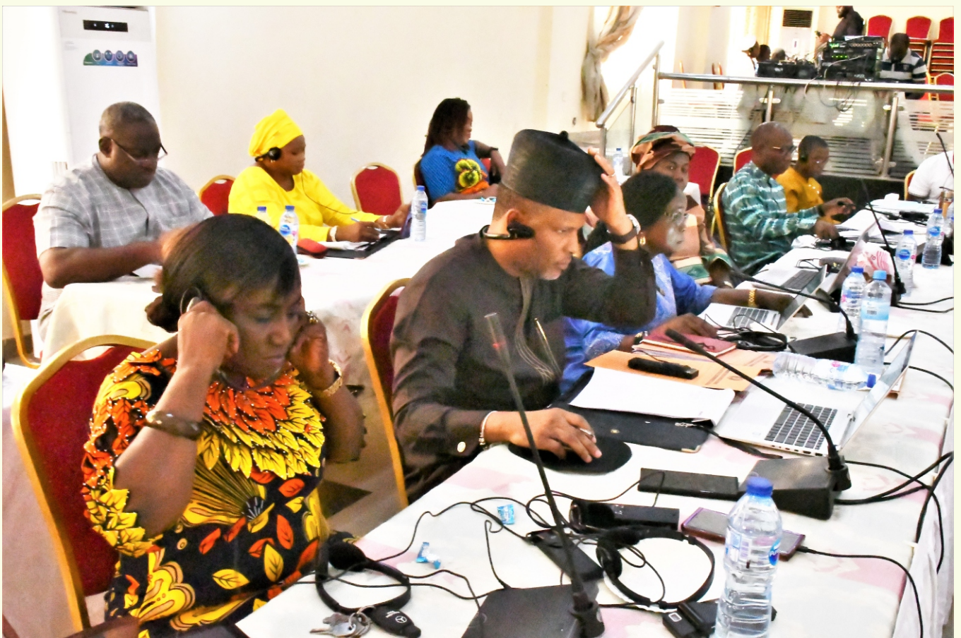
Participants listening to a presentation

The annual retreat offers an opportunity to review the progress achieved with its policies and programmes as well as discuss the activities for the next year, including its budget which is critical for the success of the Court. Staff at the retreat were drawn from all the departments of the Court.